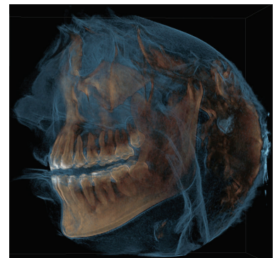
3D patient scan with bone and soft tissue

Imaging software does the rest. Yes, any view we need, on demand, from the same single scan. The system also includes treatment planning software, integrated implant planning, and the ability to order surgical guides. This means that there will be no surprises when we proceed with your treatment. We chose the Galileos 3D product because of the very low radiation exposure compared to other brands of dental 3D and up to 100 times less than traditional CT scans taken at hospitals. The 3D scan with Galileos is less than half the radiation from a traditional dental film full mouth series.